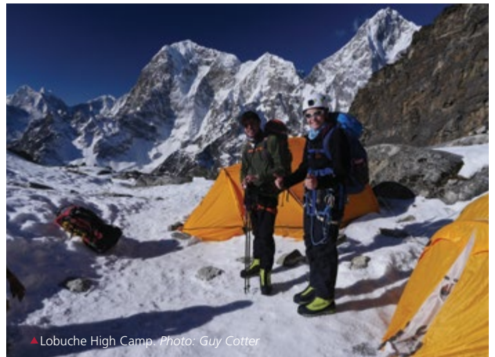
▲ Lobuche High Camp.

Our early start (around 2.30am), sees us climbing the South East Ridge, which is a mixture of snow and ice. Where necessary, we will fix ropes along the route. Steady climbing will bring us to the far eastern summit.