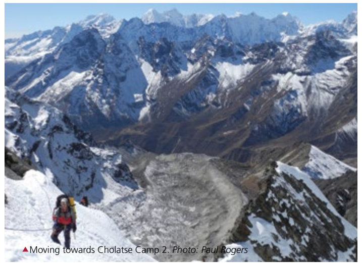
▲ Moving towards Cholatse Camp 2.