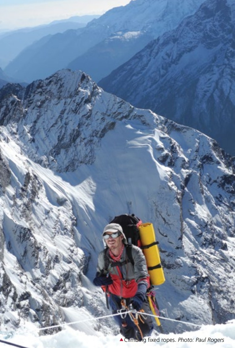
▲ Climbing fixed ropes.

NOTE: Factors such as weather, team member health and logistics etc. will no doubt create some change in the actual dates of the program.