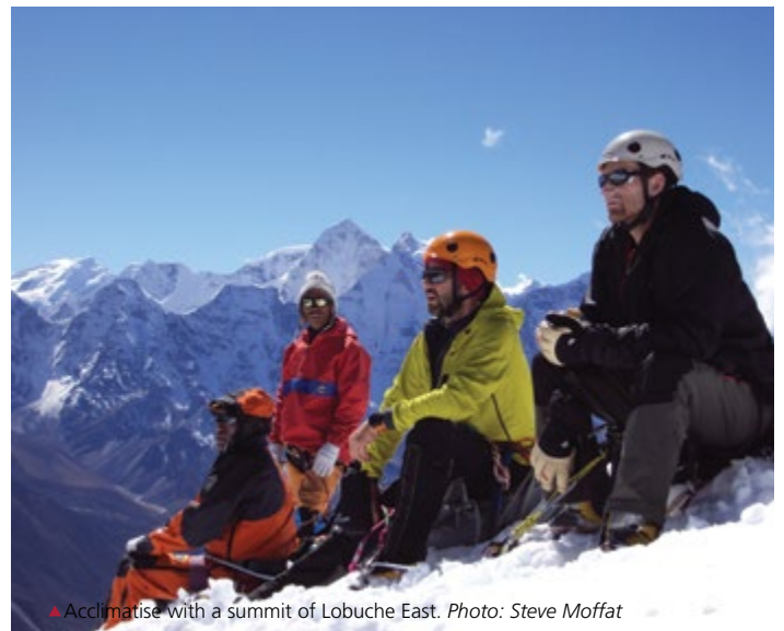
▲ Acclimatise with a summit of Lobuche East.

Food will be of the highest standard possible, given the remoteness of the situation. Please inform us if you have any special dietary requirements. During the trekking phases we will dine in lodges and at the Base Camps we will eat in a dining tent catered for by our expedition cook and support crew. Our camp equipment and nutritious meals are always the envy of other groups along the way! We do recommend that you bring some of your favourite snacks like muesli bars, chocolate and/or candy, as well as energy gels and electrolyte drinks that you are used to using.