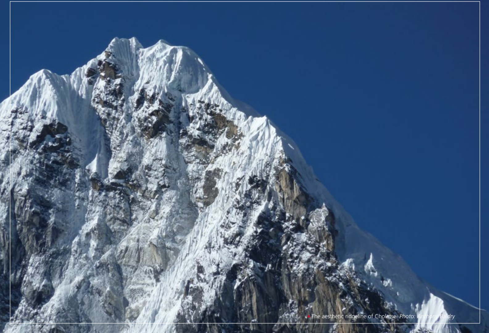
• The aesthetic ridgeline of Cholatse.