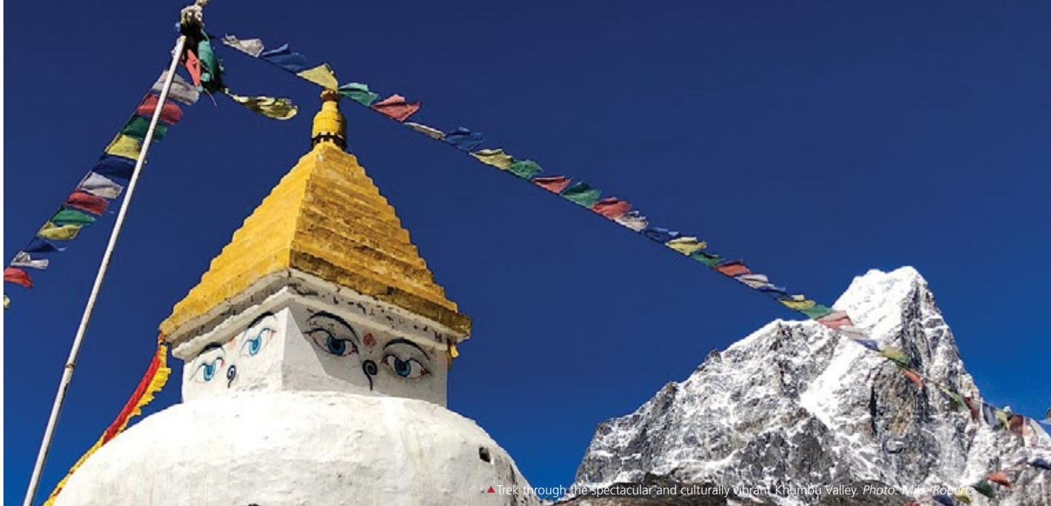
▲ Trek through the spectacular and culturally vibrant Khumbu Valley.