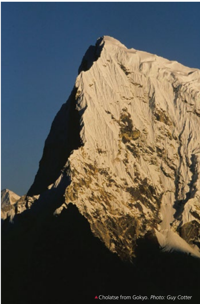
▲ Cholatse from Gokyo.