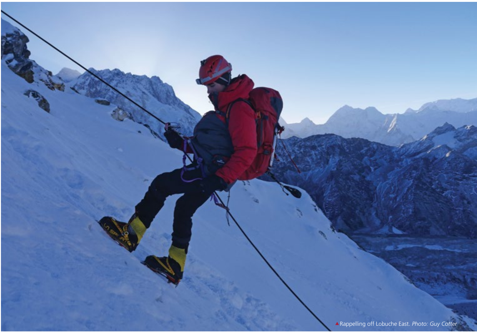
▲ Rappelling off Lobuche East.