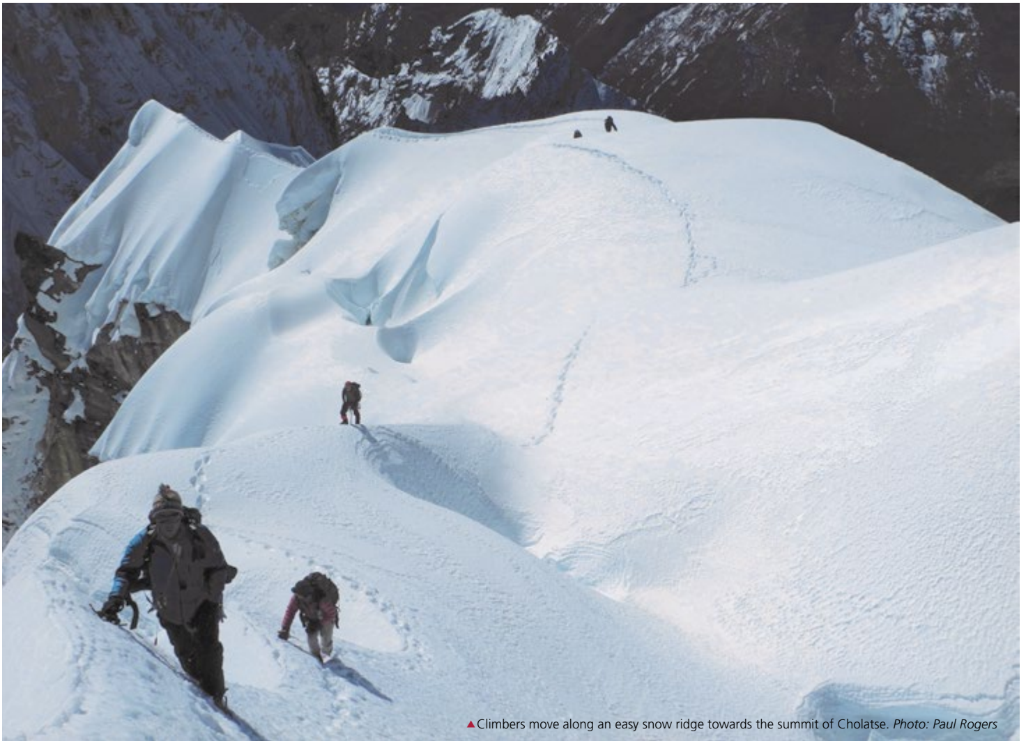
▲ Climbers move along an easy snow ridge towards the summit of Cholatse.