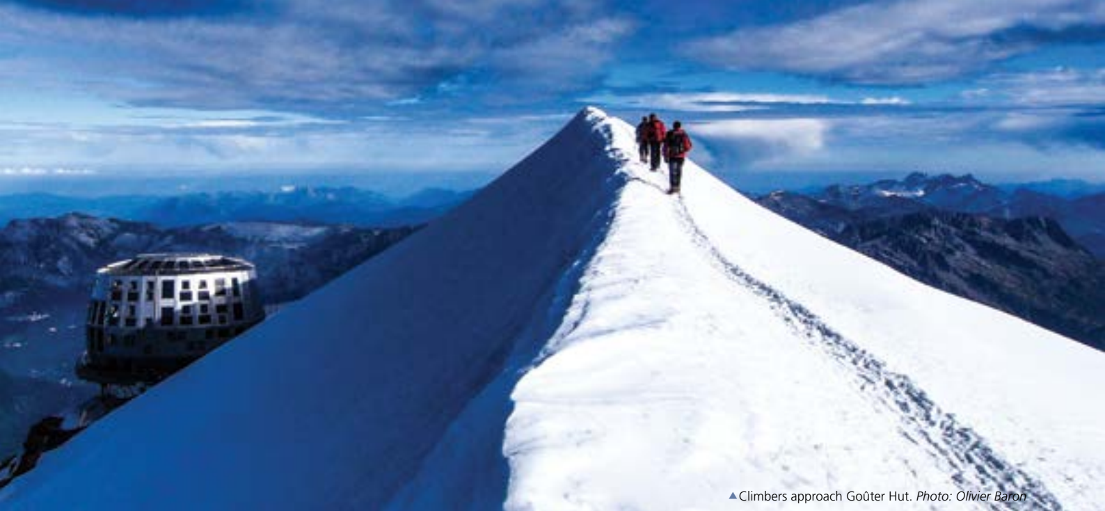
▲ Climbers approach Goûter Hut.