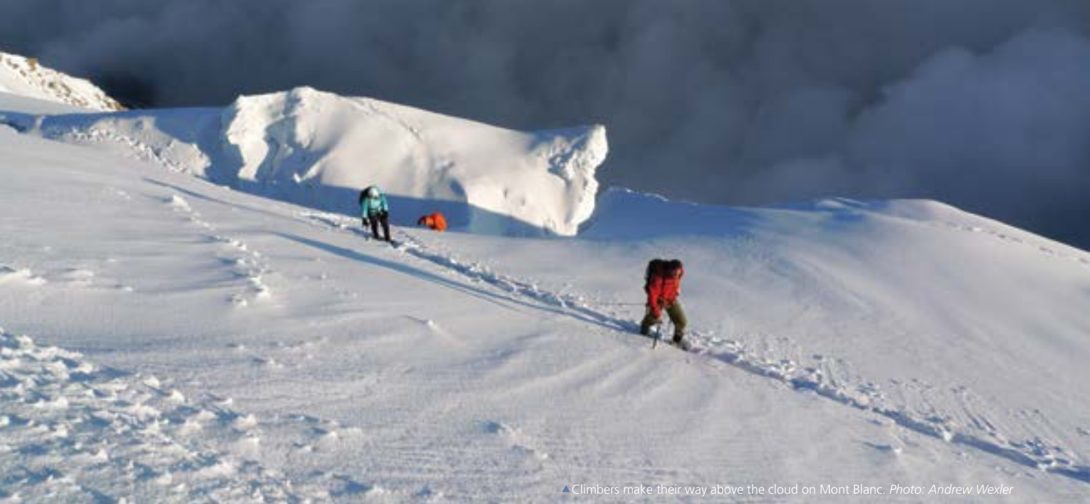
▲ Climbers make their way above the cloud on Mont Blanc.