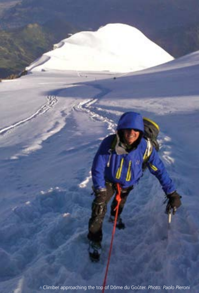
▲ Climber approaching the top of Dôme du Goûter.