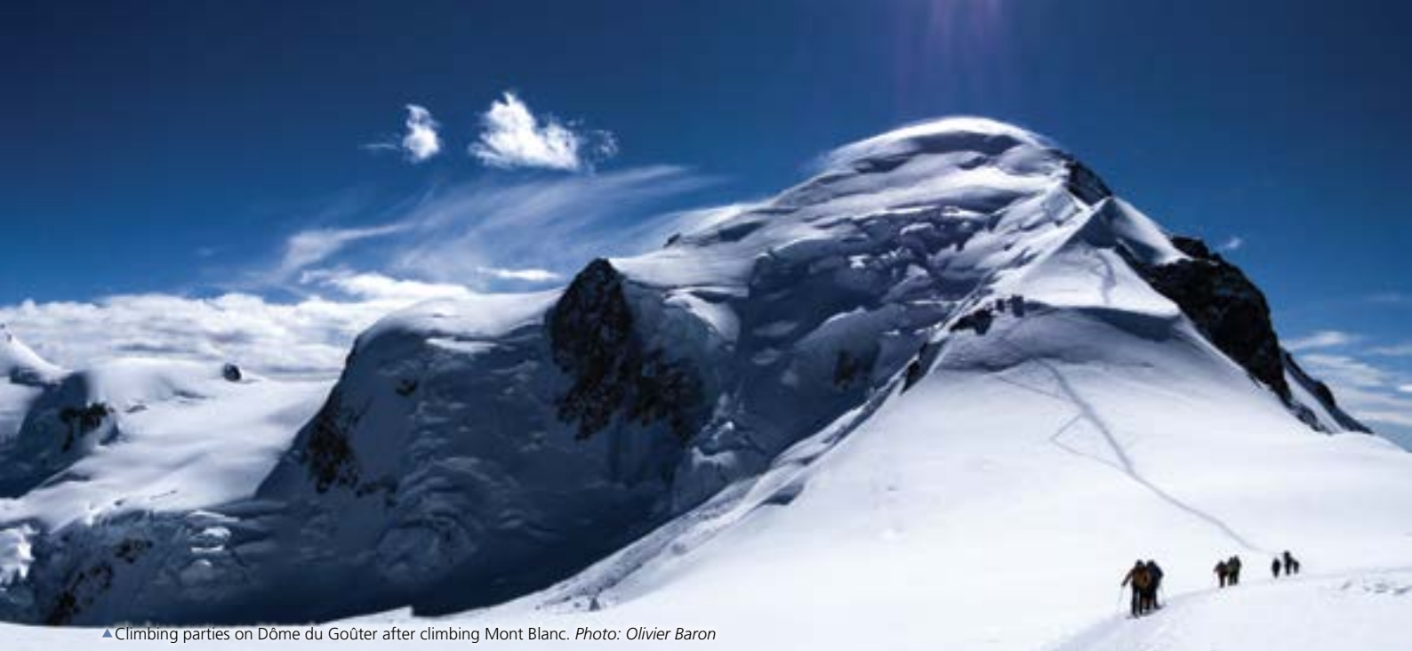
▲ Climbing parties on Dôme du Goûter after climbing Mont Blanc.

Even if you are a seasoned climber, your guide can adjust the programme to cater to your existing skill set. Whatever your existing climbing standard, the training will get you back on your feet and you will benefit from the acclimatisation of sleeping up high, as well as enjoying the spectacular surrounds.