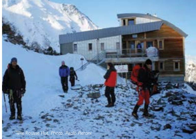
Tête Rousse Hut.