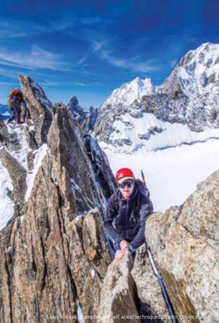
▲ Learn ice axe, crampon and self arrest techniques.