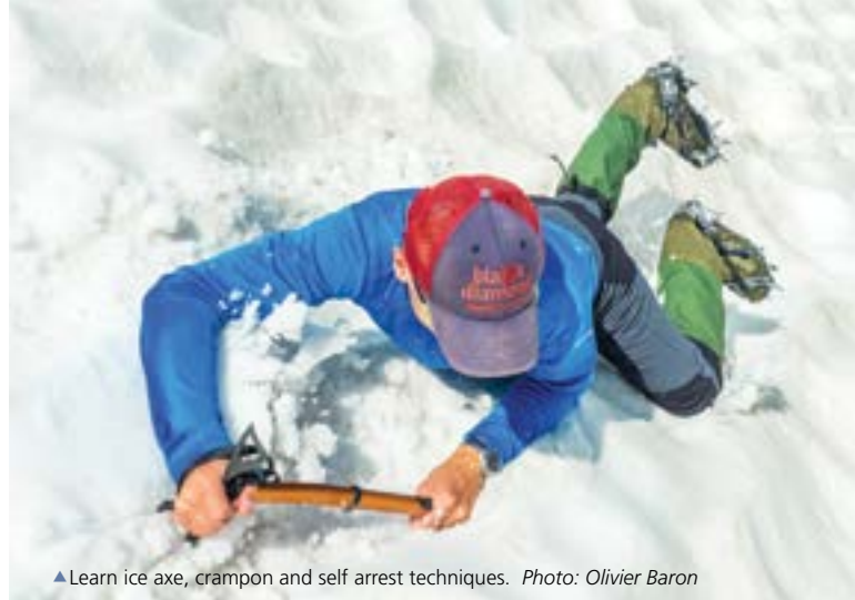
▲ Learn ice axe, crampon and self arrest techniques.