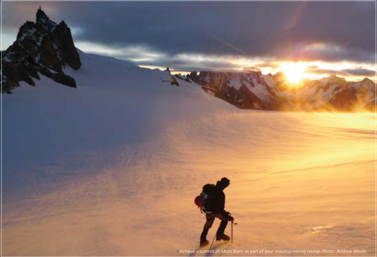
• Achieve a summit of Mont Blanc as part of your mountaineering course.