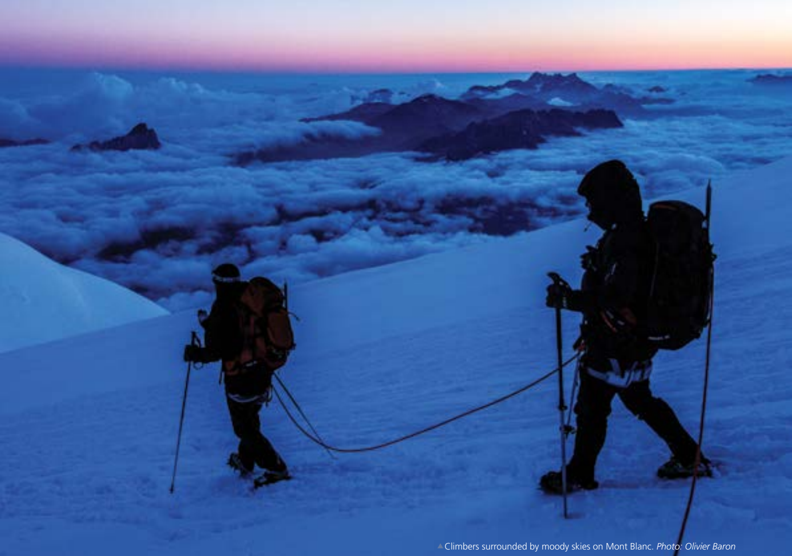
▲ Climbers surrounded by moody skies on Mont Blanc.