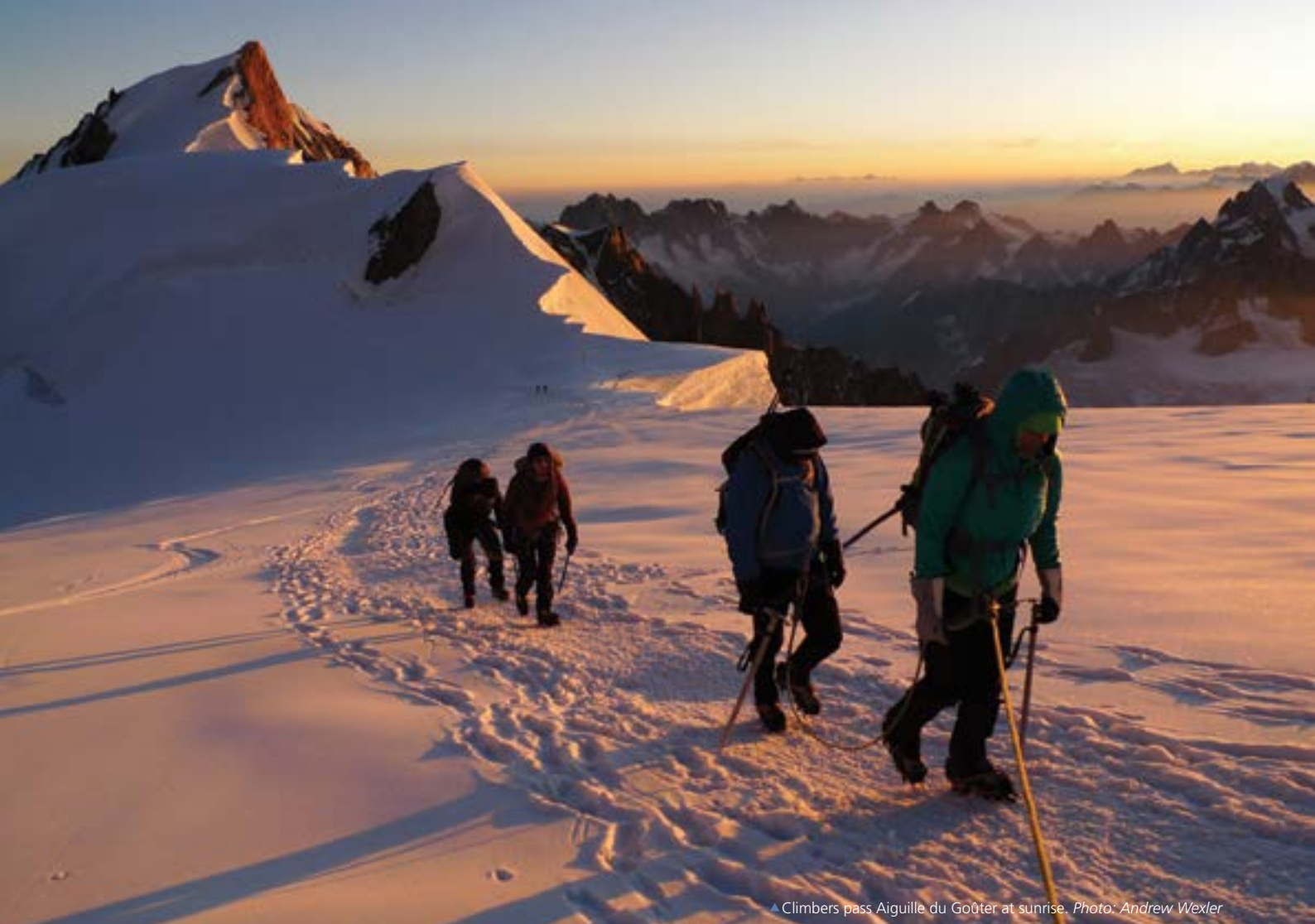
▲ Climbers pass Aiguille du Goûter at sunrise.

You will be sent an equipment checklist on confirmation of your booking. Your guide will go through this with you at the beginning of your trip. You can rent technical equipment for the climb, but you must provide your own mountaineering clothing as per the equipment list. Actual equipment taken may vary subject to seasonal weather and route conditions. Group equipment including ropes and technical hardware will be provided by your guide.