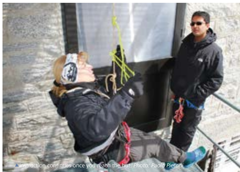
▲ Instruction continues once you reach the hut.

It takes many years to attain IFMGA status, which ensures you get a world-class professional service.