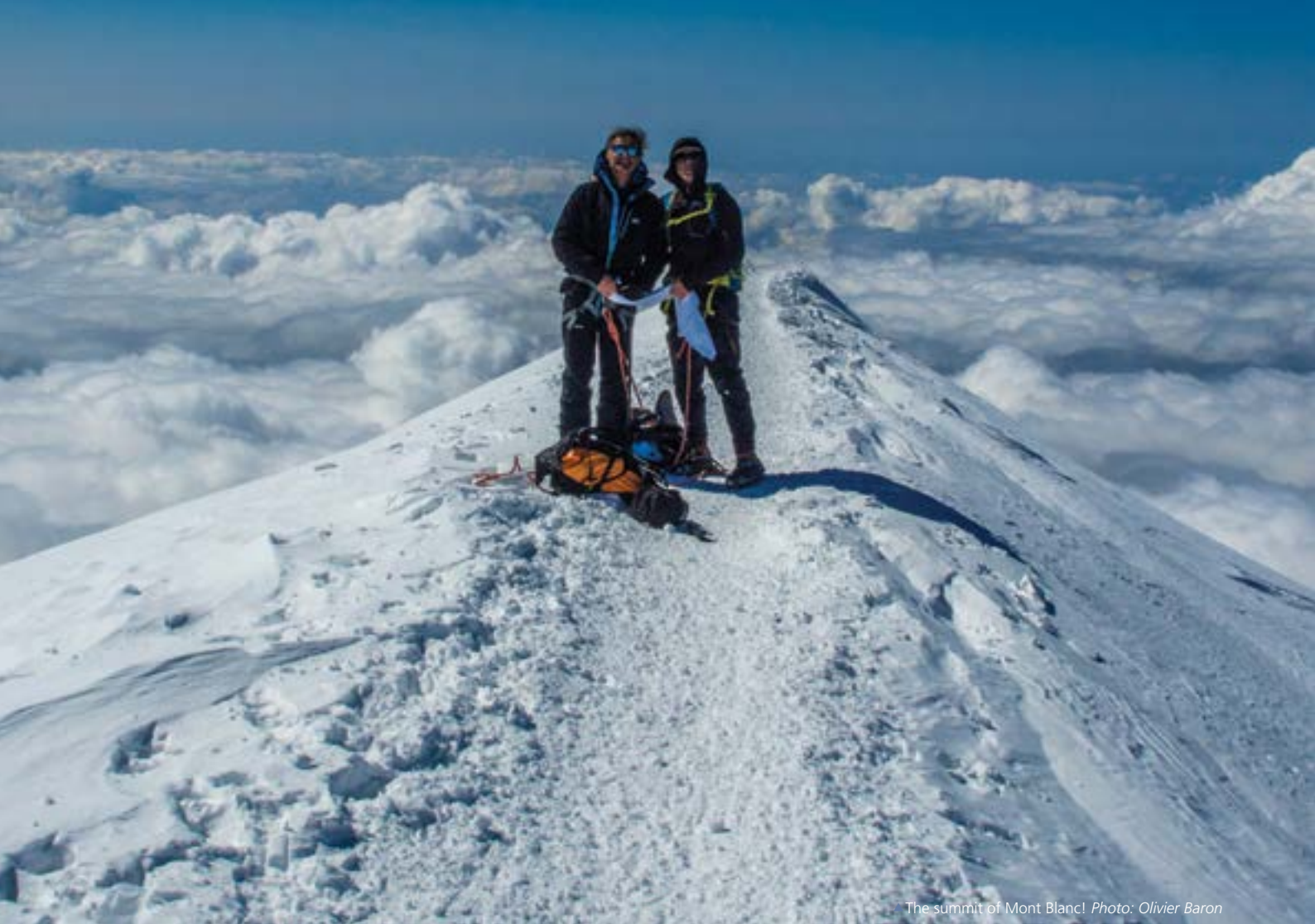
The summit of Mont Blanc!

This is from breakfast on Day 1 until breakfast on your departure day. You will be responsible for your own lunch and snacks each day, plus evening meals on the non-mountain nights in Chamonix. This allows you to experience the exciting culinary options available in Chamonix as there are many restaurants and bars within close walking distance that provide a variety of foods to suit your tastes. Any additional food, bottled water, beverages or meals you purchase that are not mentioned in the inclusions will be at your own expense.