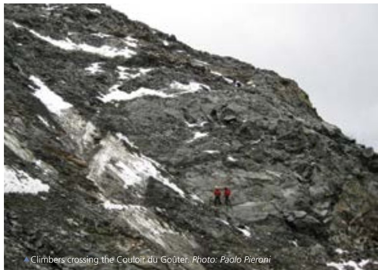
▲ Climbers crossing the Couloir du Goûter.