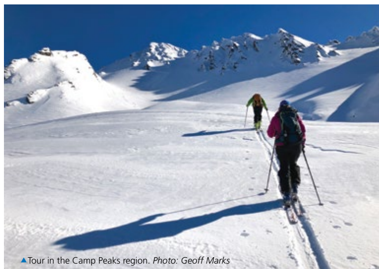
Tour in the Camp Peaks region.