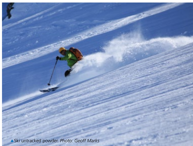
▲ Ski untracked powder.

If you intend to buy equipment items, we are happy to advise on suitable brands and models. We offer our clients discounted prices on a selection of climbing equipment and clothing, and can arrange for it to be available upon your arrival.