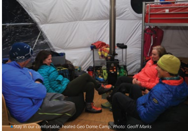
Stay in our comfortable, heated Geo Dome Camp.