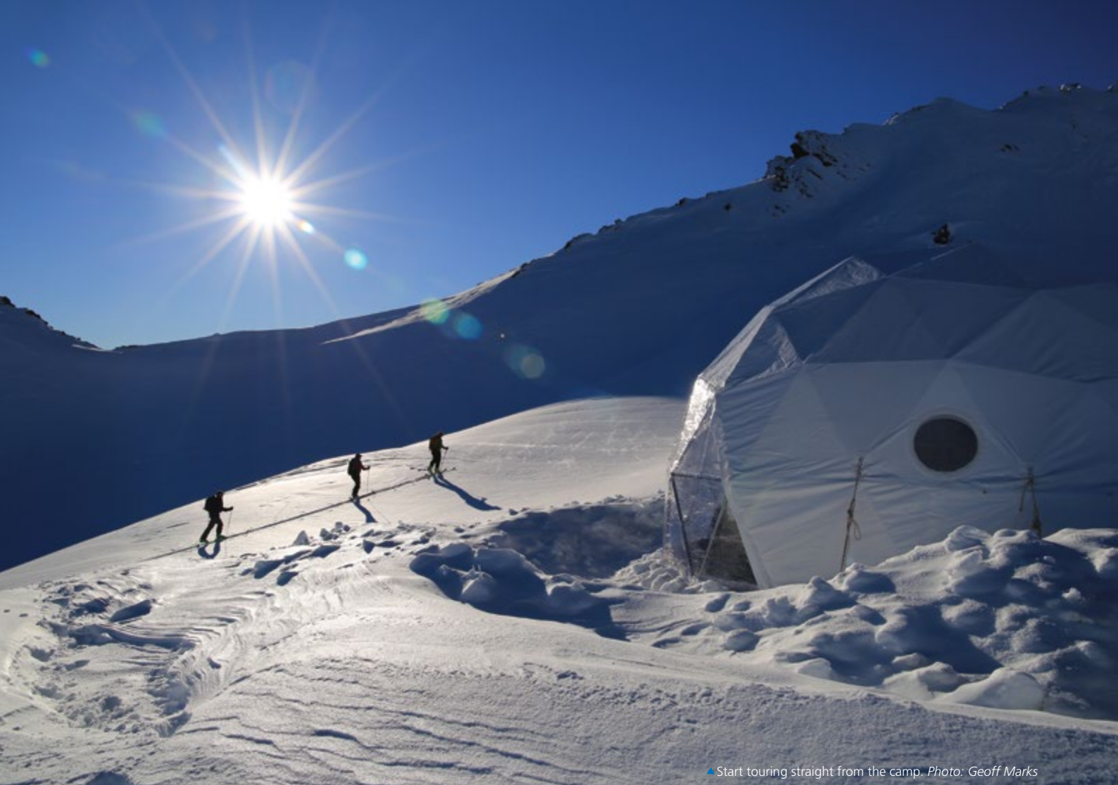
▲ Start touring straight from the camp.