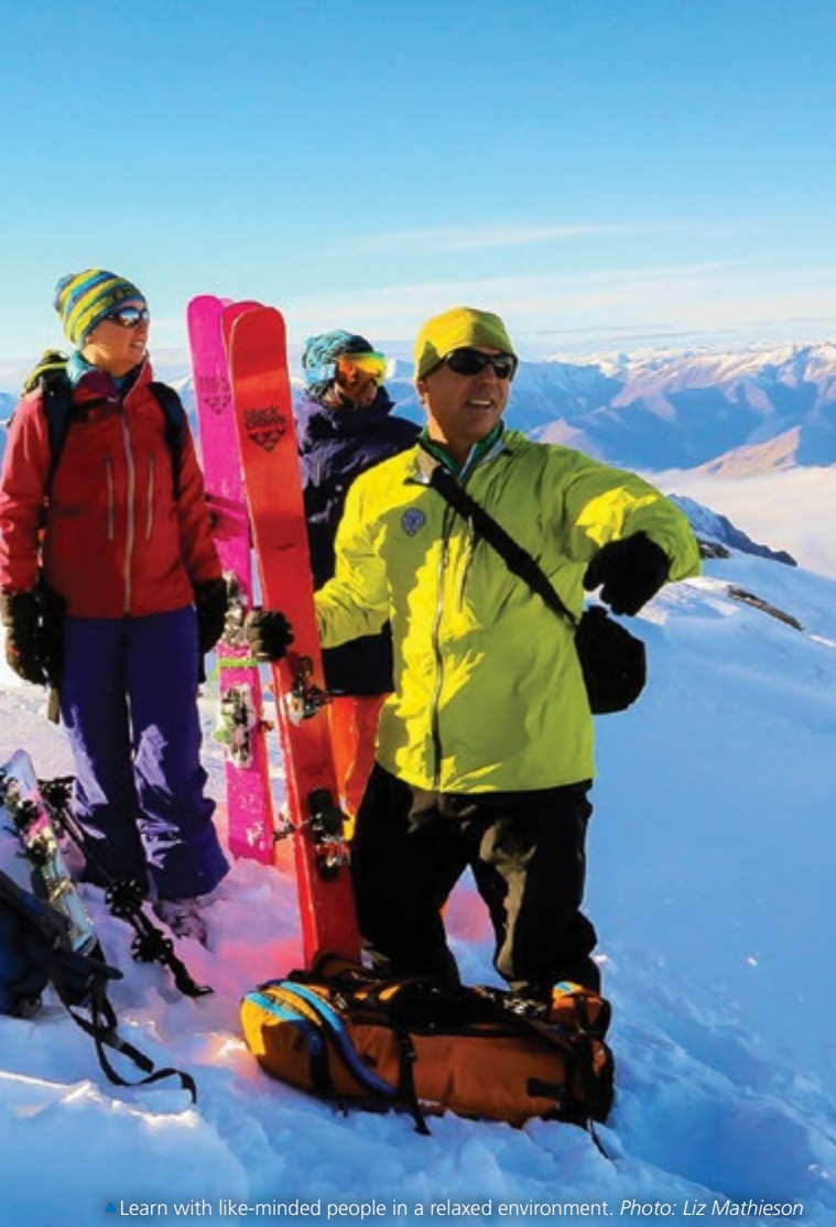
Learn with like-minded people in a relaxed environment.