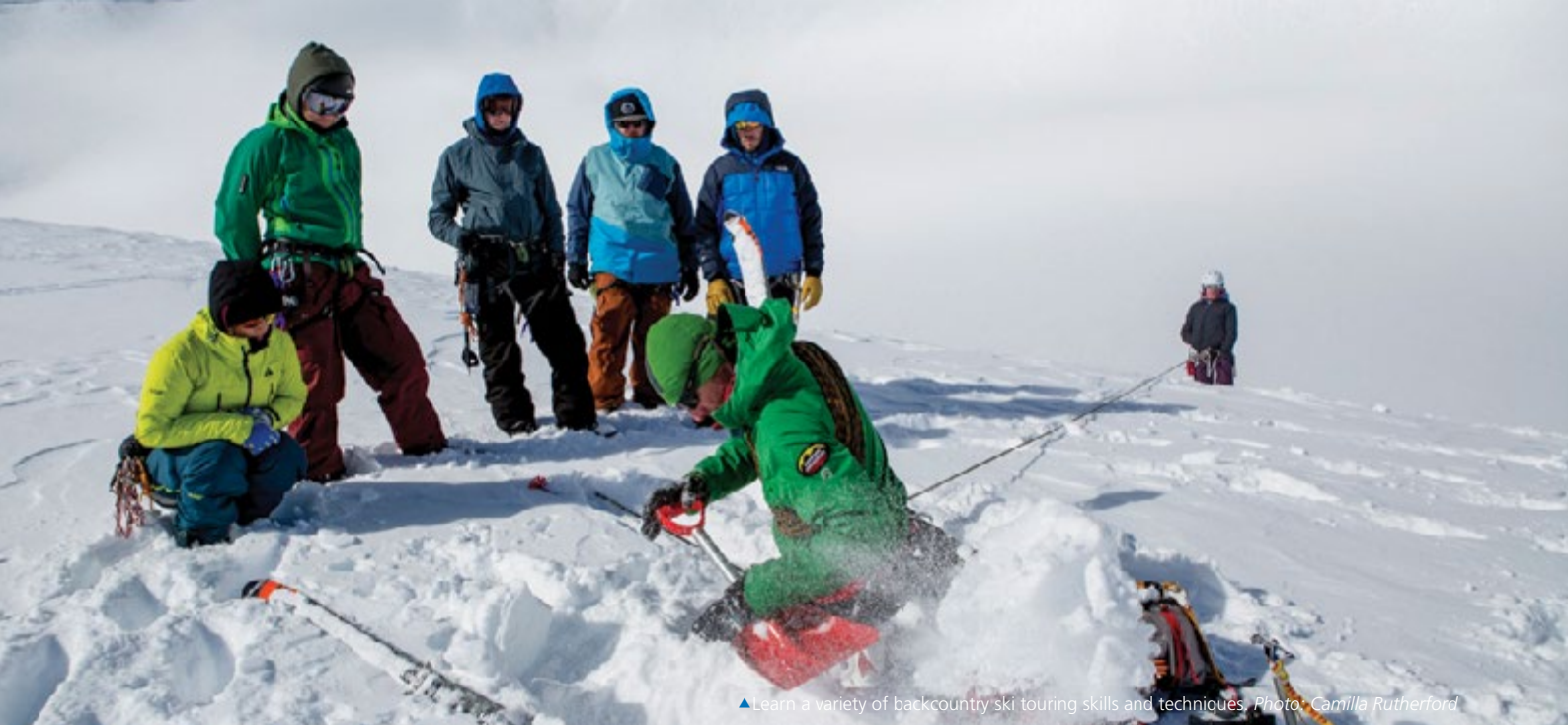
▲ Learn a variety of backcountry ski touring skills and techniques.

We then drive around the shores of Lake Hawea (around half an hour's drive), load up the helicopter and fly into the mountains. Leaving our gear in the camp, we're off for a ski/board!