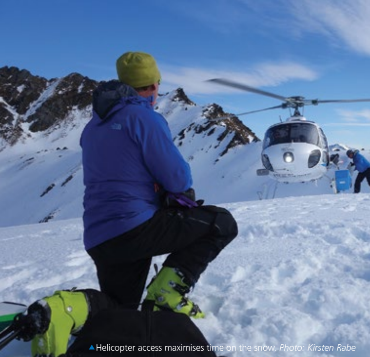
▲ Helicopter access maximises time on the snow.