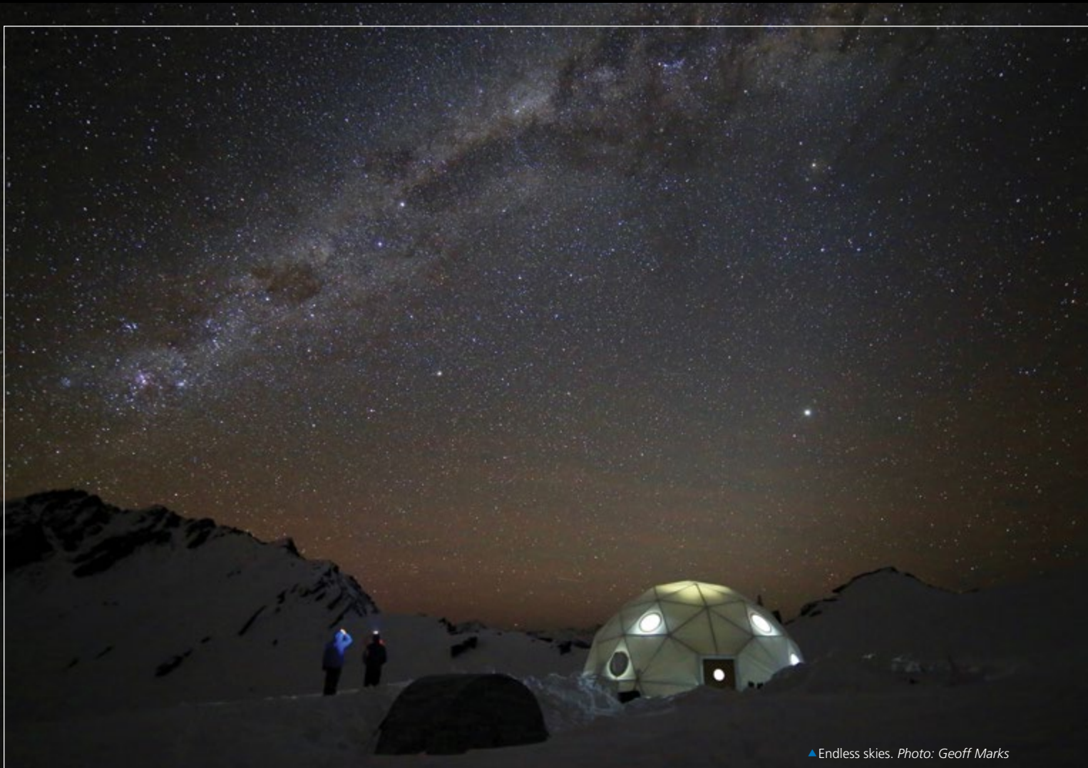
▲ Endless skies.