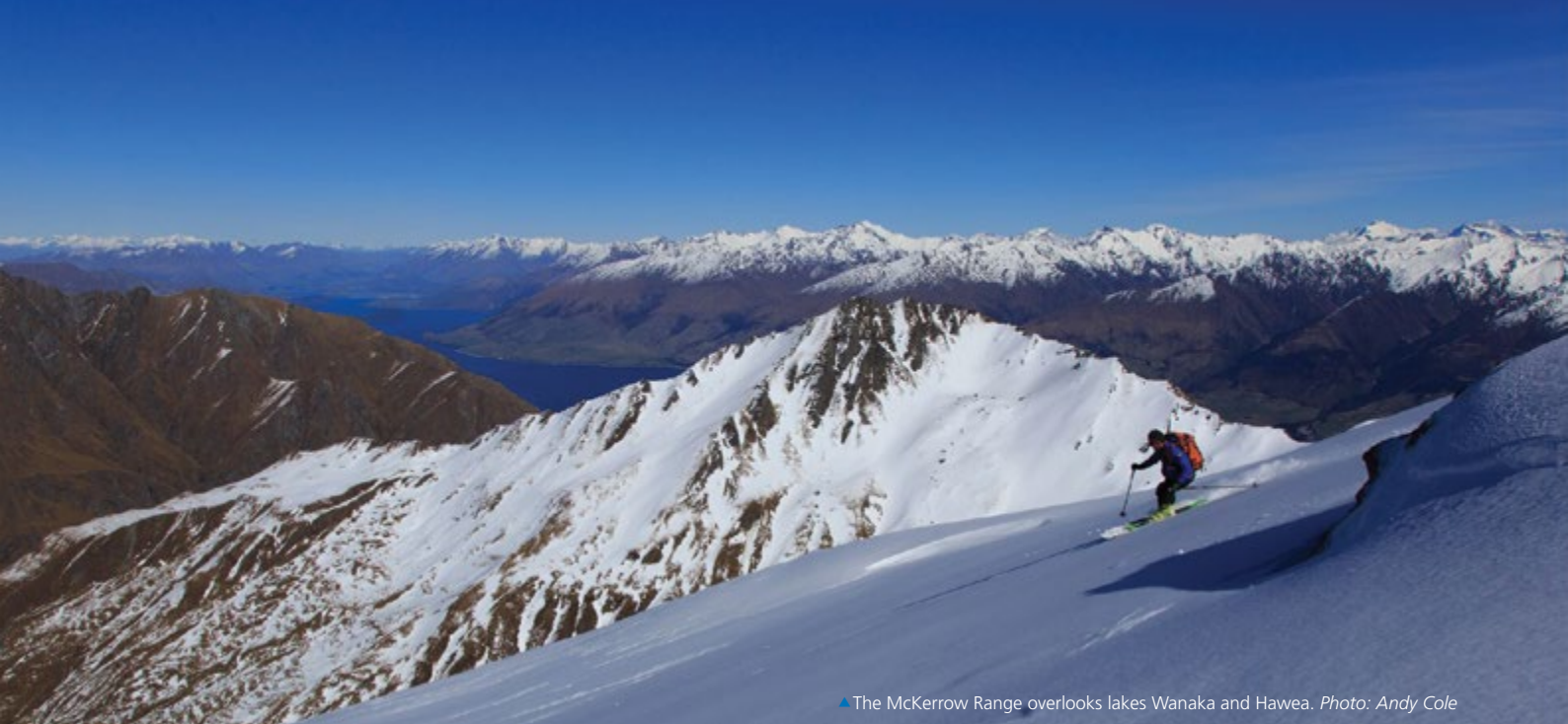
▲ The McKerrow Range overlooks lakes Wanaka and Hawea.