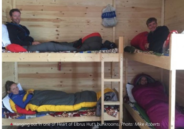
▲ Hanging out in one of Heart of Elbrus Hut's bunkrooms.