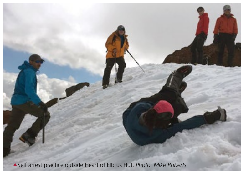
▲ Self arrest practice outside Heart of Elbrus Hut.

The visa process normally takes about 4 weeks, although it has been known to take up to 10 weeks. You can begin the visa process up to 3 months in advance so we advise that you submit your application as soon as you have received the relevant documentation from our office.