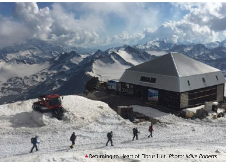
▲ Returning to Heart of Elbrus Hut.