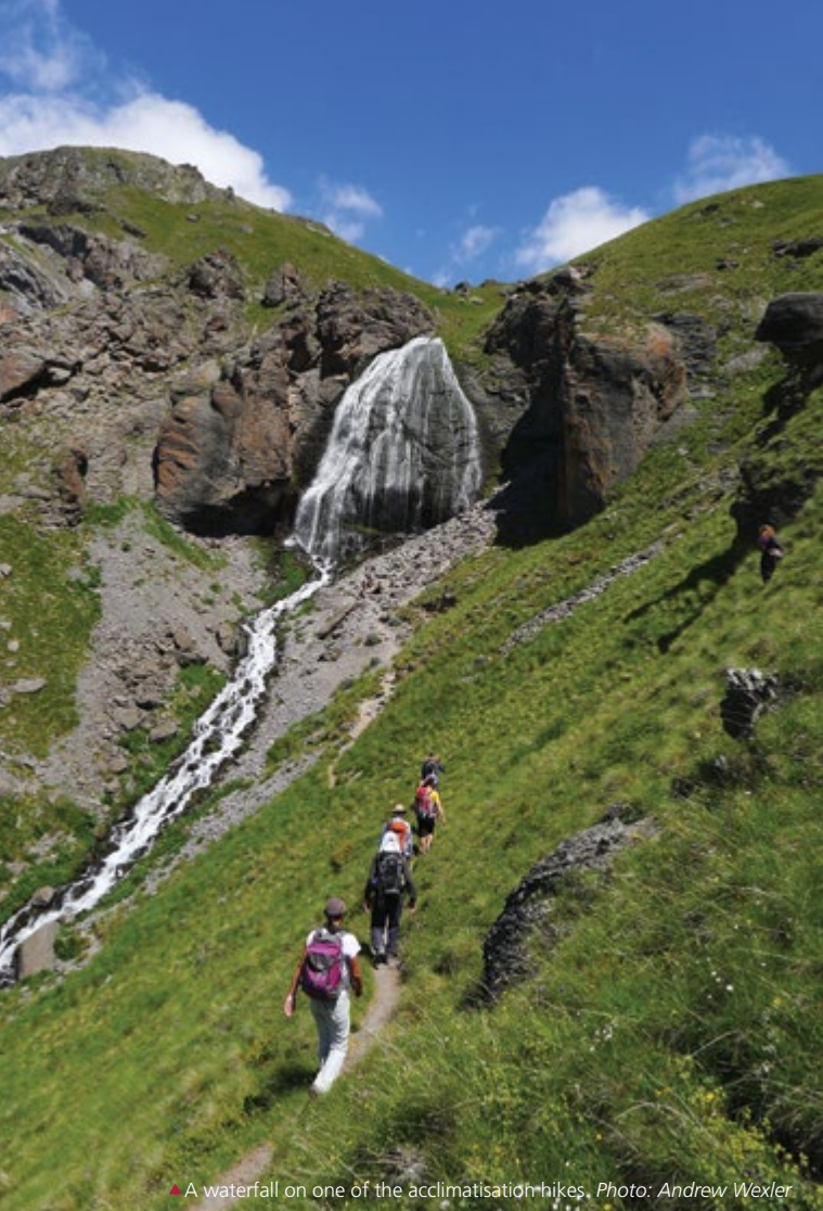
▲ A waterfall on one of the acclimatisation hikes.