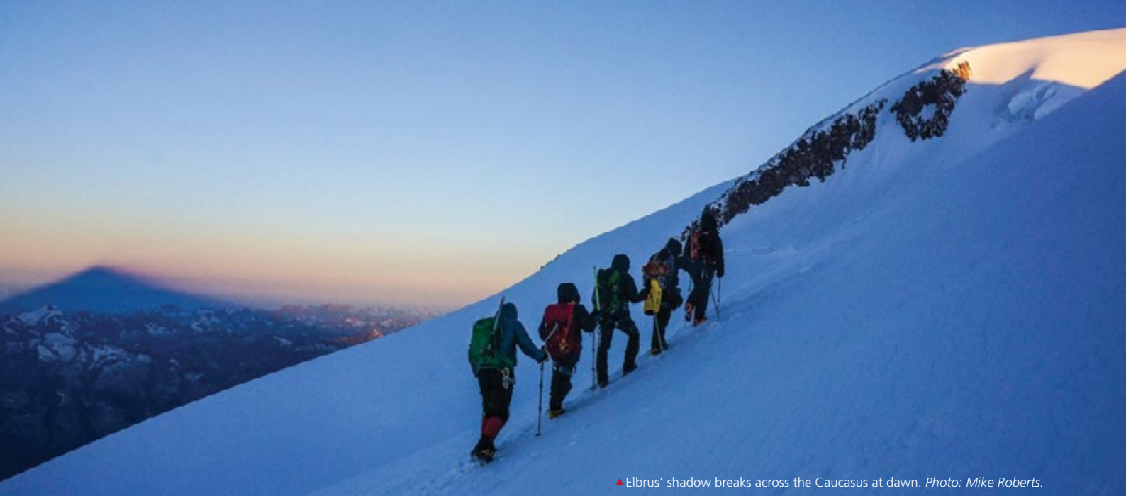
▲ Elbrus' shadow breaks across the Caucasus at dawn.