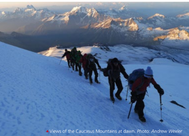
▲ Views of the Caucasus Mountains at dawn.