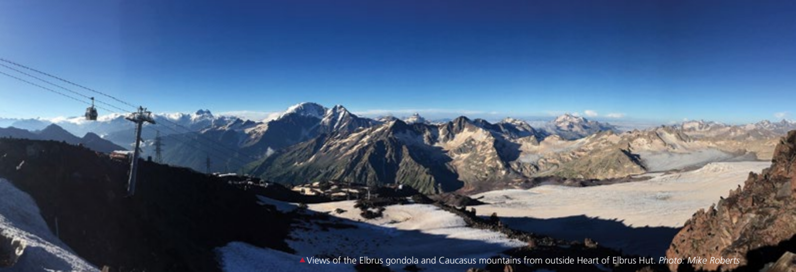
▲ Views of the Elbrus gondola and Caucasus mountains from outside Heart of Elbrus Hut.