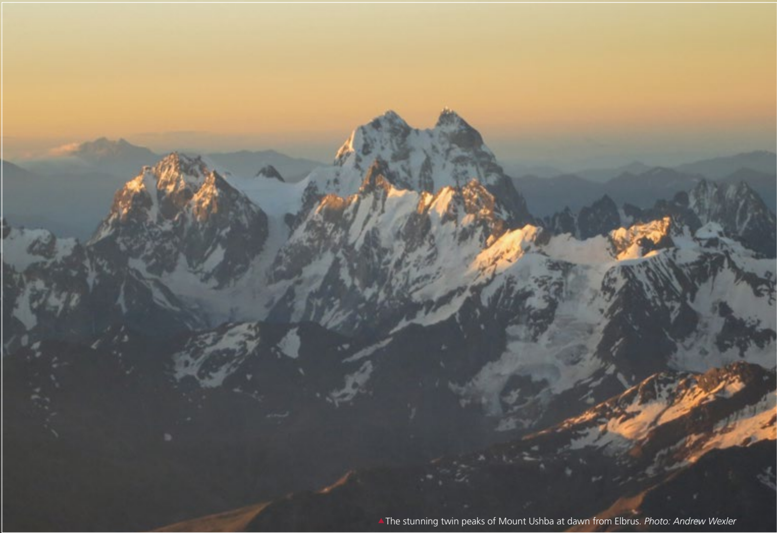
▲ The stunning twin peaks of Mount Ushba at dawn from Elbrus.