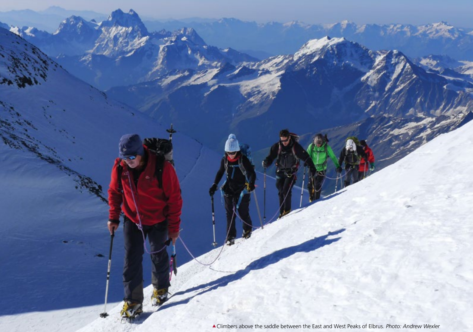
▲ Climbers above the saddle between the East and West Peaks of Elbrus.