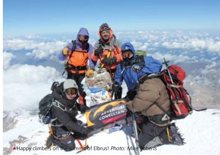
▲ Happy climbers on the summit of Elbrus!