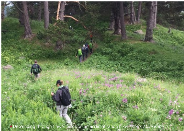
▲ Descending through flower fields on an acclimatisation hike.

in every expedition to offer our climbers the best possible chance of success.