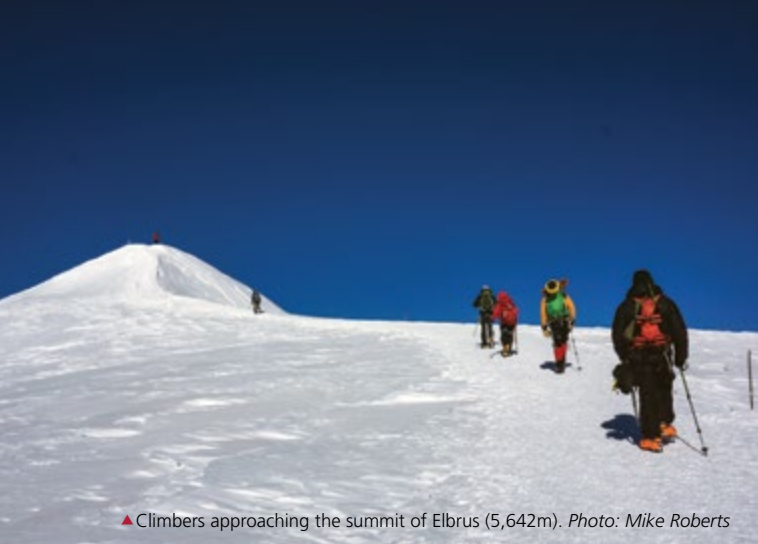
▲ Climbers approaching the summit of Elbrus (5,642m).