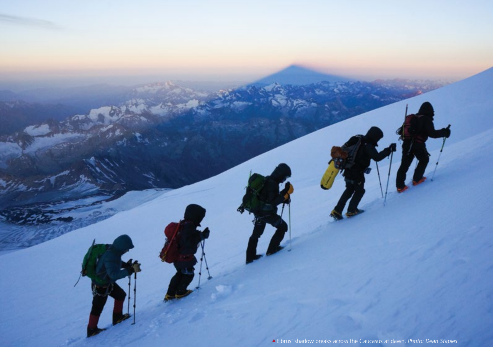
▲ Elbrus' shadow breaks across the Caucasus at dawn.