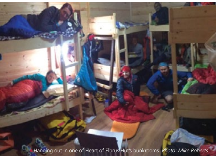
◆ Hanging out in one of Heart of Elbrus Hut's bunkrooms.