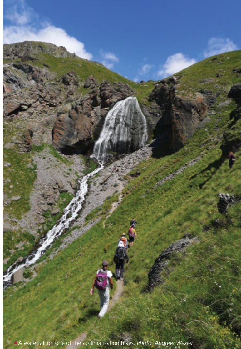
▲ A waterfall on one of the acclimatisation hikes.