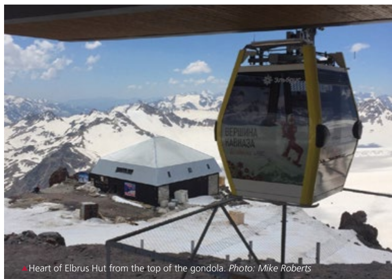
▲ Heart of Elbrus Hut from the top of the gondola.

NOTE: We also operate a shorter 12-day Elbrus Trip 2 initiating and concluding in Moscow between July 17–28, 2023.