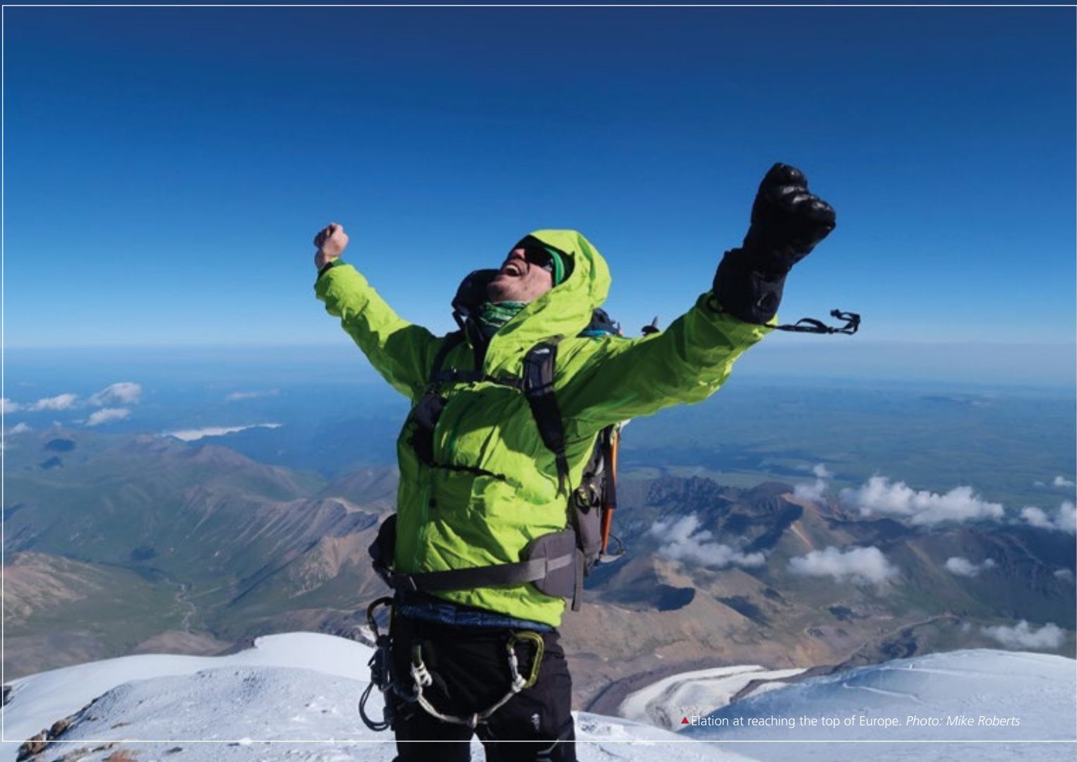
▲ Elation at reaching the top of Europe.