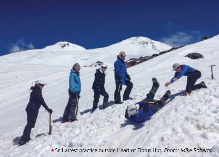
▲ Self arrest practice outside Heart of Elbrus Hut.