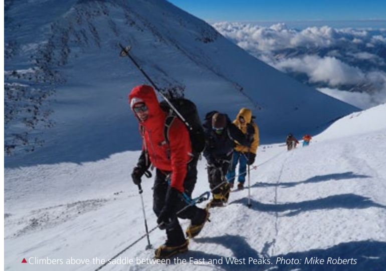
▲ Climbers above the saddle between the East and West Peaks.