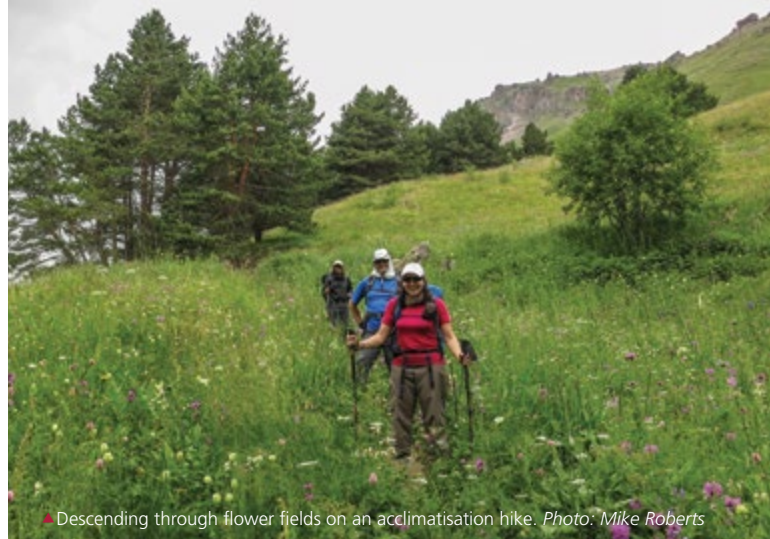
▲ Descending through flower fields on an acclimatisation hike.