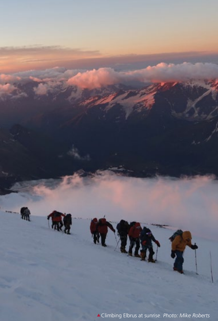
▲ Climbing Elbrus at sunrise.