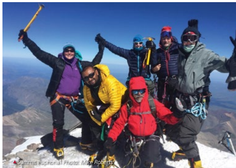
▲ Summit euphoria!