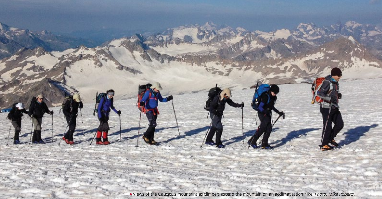
▲ Views of the Caucasus mountains as climbers ascend the mountain on an acclimatisation hike.