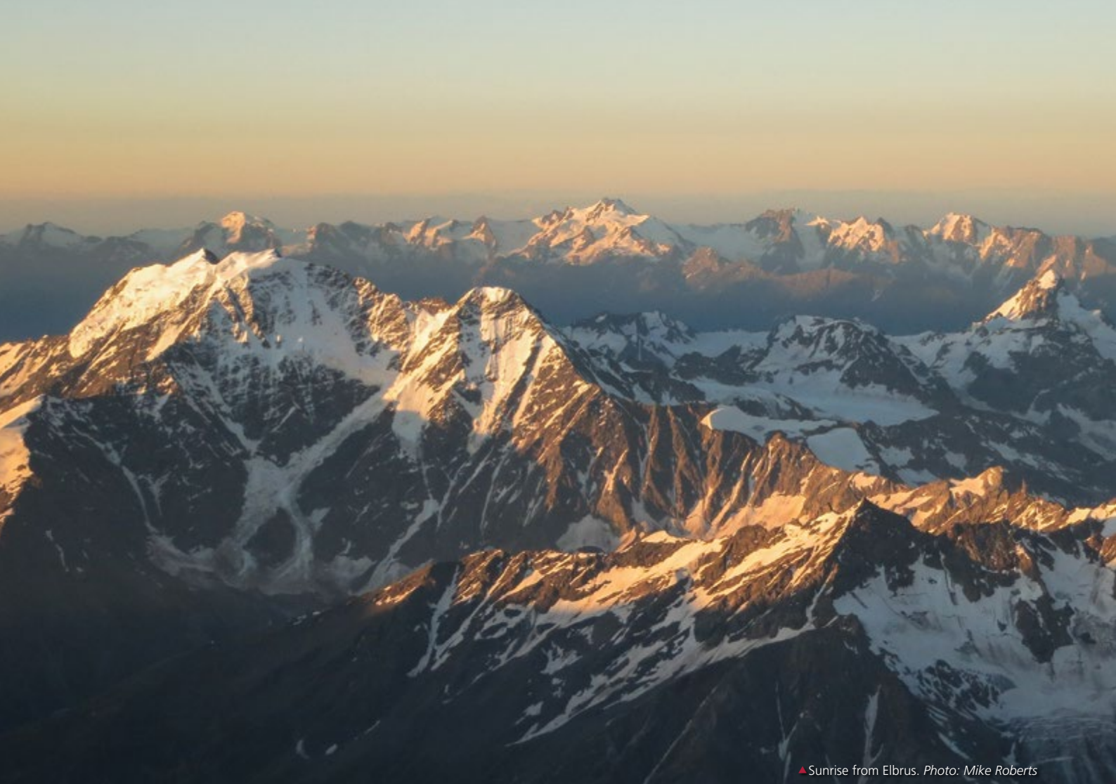
▲ Sunrise from Elbrus.